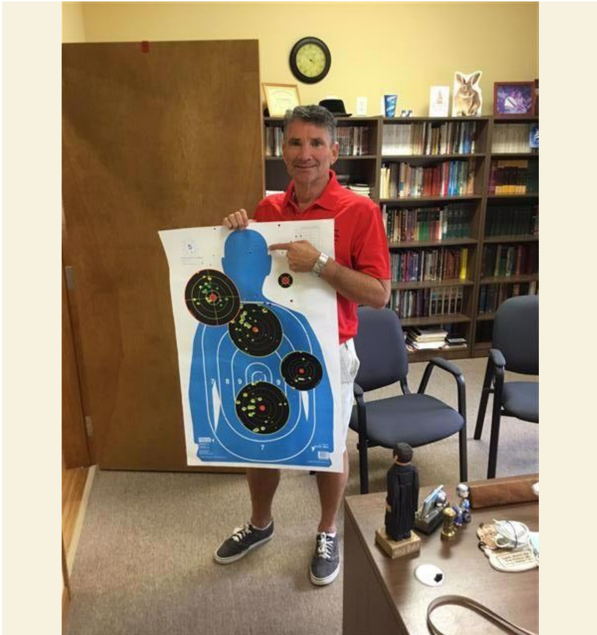
Defenders At Open Bible Target Newcomers